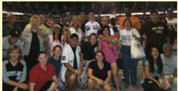
Lewis alumni enjoy the fun at U.S. Cellular Field.