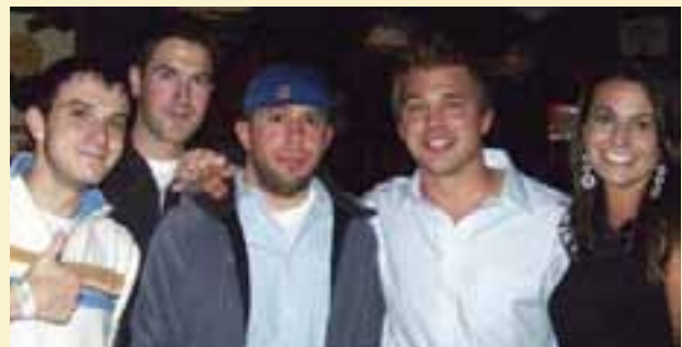
Young alumni and friends gathered at a post game reception at McGee's Tavern.