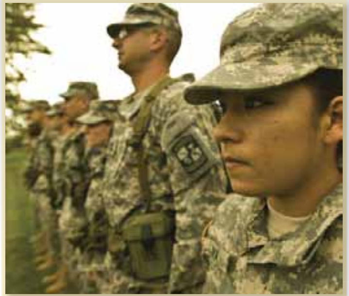
ROTC cadets stand in formation as they prepare to engage in maneuvers.

This event followed the Lewis University ROTC's success with coordinating Operation Good Time. The September event raised about $2,000 to send packages to U.S. troops serving overseas. A multi-faceted program featured family-friendly activities on the