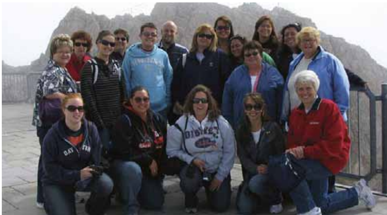
College of Education travelers make the most of a photo opportunity near the highest point in Germany in the Bavarian Alps. The group spent 10 days traveling throughout Austria and Germany in July, 2008.