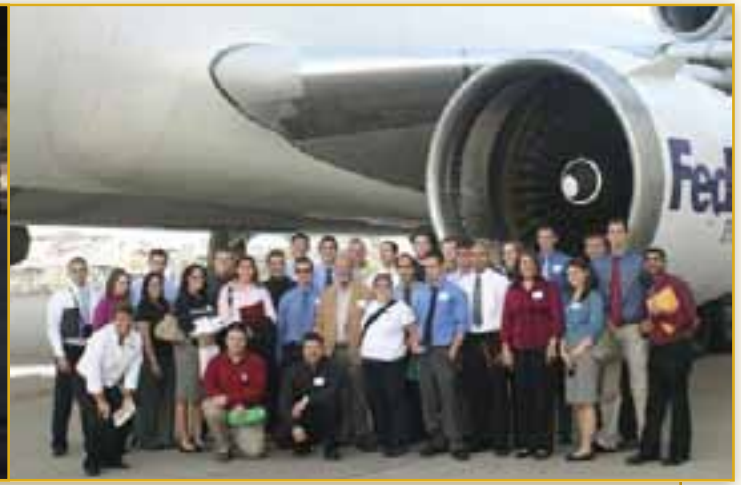
Members of the Lewis University Chapter of the American Association of Airport Executives (AAAE) tour the FedEx's Global Operations Center in Memphis, Tenn.