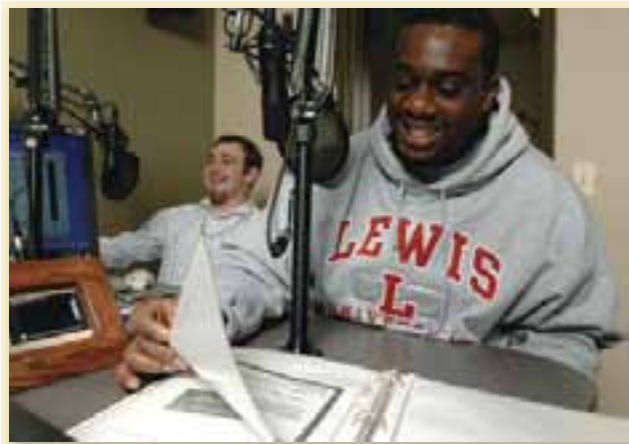
The WLRA-FM student broadcasting marathon raised a new record donation for Hope Children's Hospital.

The donations are used to assist families of hospitalized children in their greatest time of need. Advocate Hope Children's Hospital is located on the campus of Christ Medical Center in Oak Lawn, Ill. For more information or to give further support, please call WLRA radio at wbra@lewisu.edu or phone (815) 836-5214.