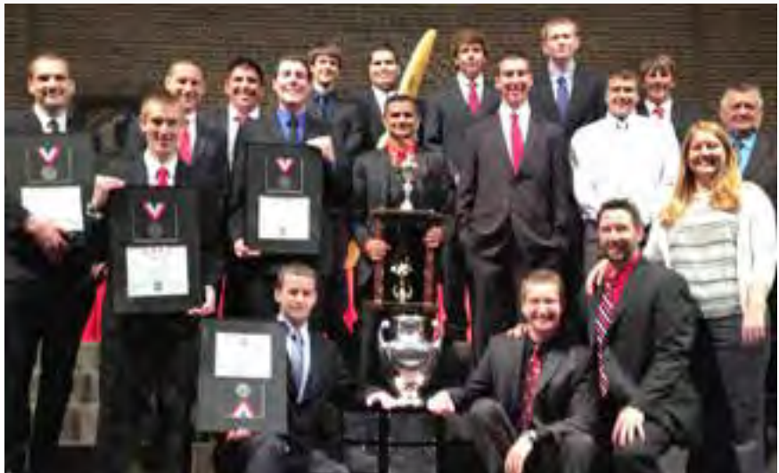
Lewis University Flight Team earned 8th place at the National Intercollegiate Flying Association Safety and Flight Evaluation Conference (SAFECON), numerous individual awards and the Loening Trophy.